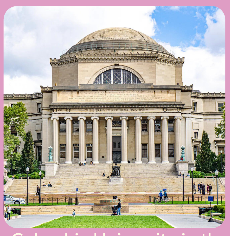
Columbia University in the United States