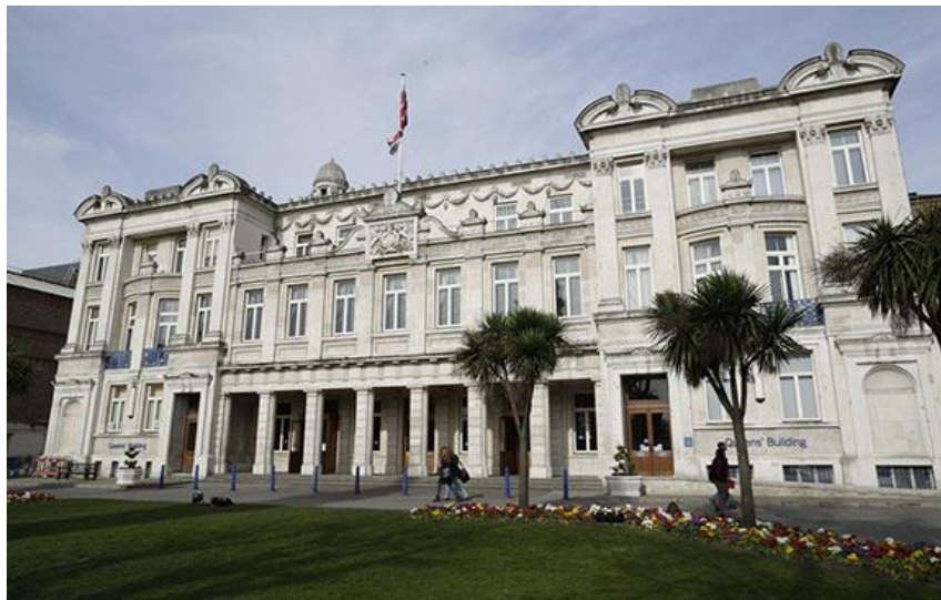
Queen's Building, Queen Mary, University of London

Conference dinner: Senior Common Room, Queen's Building