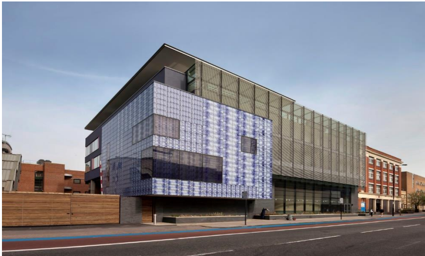
Arts Two Building, Queen Mary, University of London

The conference will be held from 11-12 April 2016 at the Queen Mary's Mile End Campus (Arts Two Building).