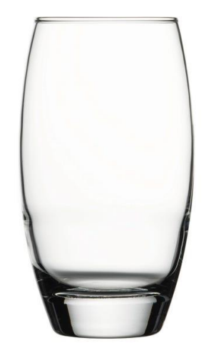
Figure 2: a glass of water

Being mindful of how you communicate and the environment you create can help to support a student's emotional regulation and engagement at Queen Mary.