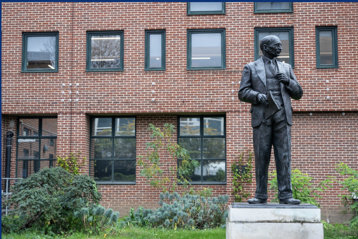
Atlee Square at Queen Mary University of London's Mile End Campus. The acquisition of the Clement Atlee statue was supported by the MEI's founder and patron, Lord Hennessy of Nympsfield.