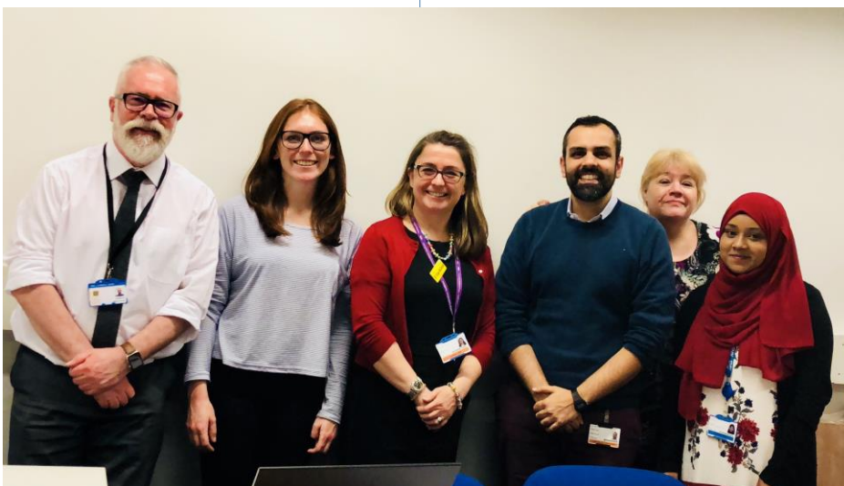
The UK ITP Registry team