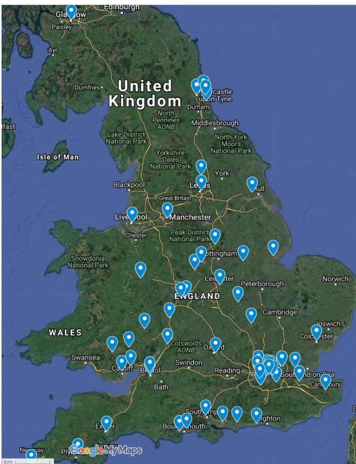
Map to highlight the spread and locations of all the sites that are actively recruiting and following up patients in the registry.

The NIHR has recently changed the reporting of recruitment activity on CPMS. We have circulated this information previously, but as a reminder, the flow chart below depicts the new process.