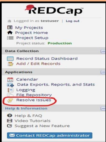
Figure 1. Screenshot of REDCap home screen to show the 'Resolve Issues' link.

As mentioned previously, please continue to check the 'Resolve Issues' link on REDCap to review which fields/forms have been queried or need completing (Figure 1).