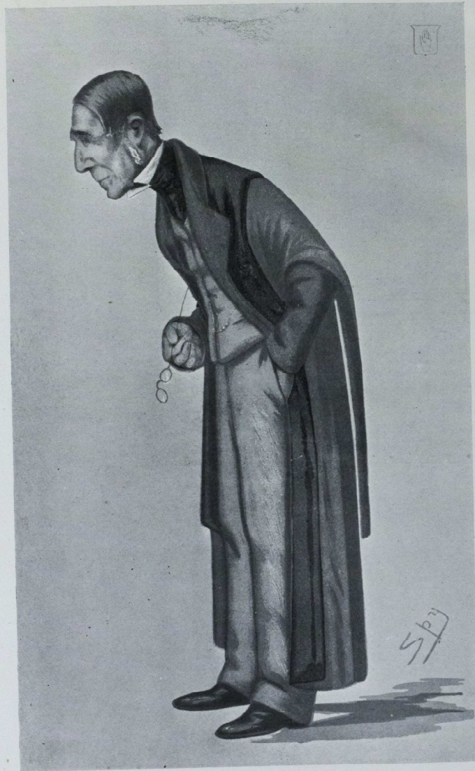
SIR JAMES PAGET, BART.

By kind permission of the Proprietors of 'Vanity Fair.'