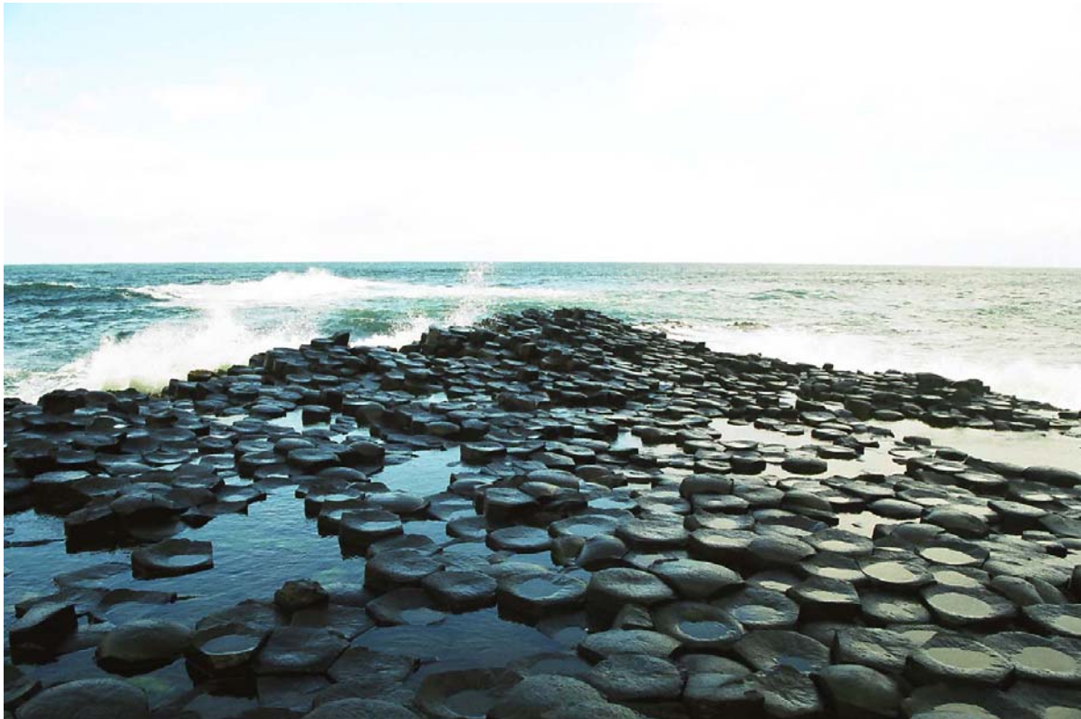
The Giant's Causeway in Northern Ireland

The most famous giant in Irish folklore is Finn Mac Cuamhail (McCool). Finn was a mythical warrior and a giant. Stories about Finn claimed that he had built the Giant's Causeway in County Antrim as stepping-stones to Scotland. It was also believed that he had scooped part of Ireland out of the ground to fling at a rival. This clump of land fell into the sea and became the Isle of Man and the void left behind became Lough Neagh.