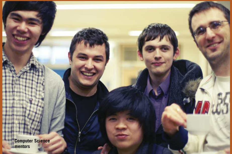
Computer Science mentors

Delegates at the PASS National Centre Meeting at the University of Manchester in February were brought up to date with recent developments in our schemes in a presentation, PASS at Queen Mary: Strength in Diversity . Thanks to our colleagues at Manchester for their friendly welcome and stimulating ideas.