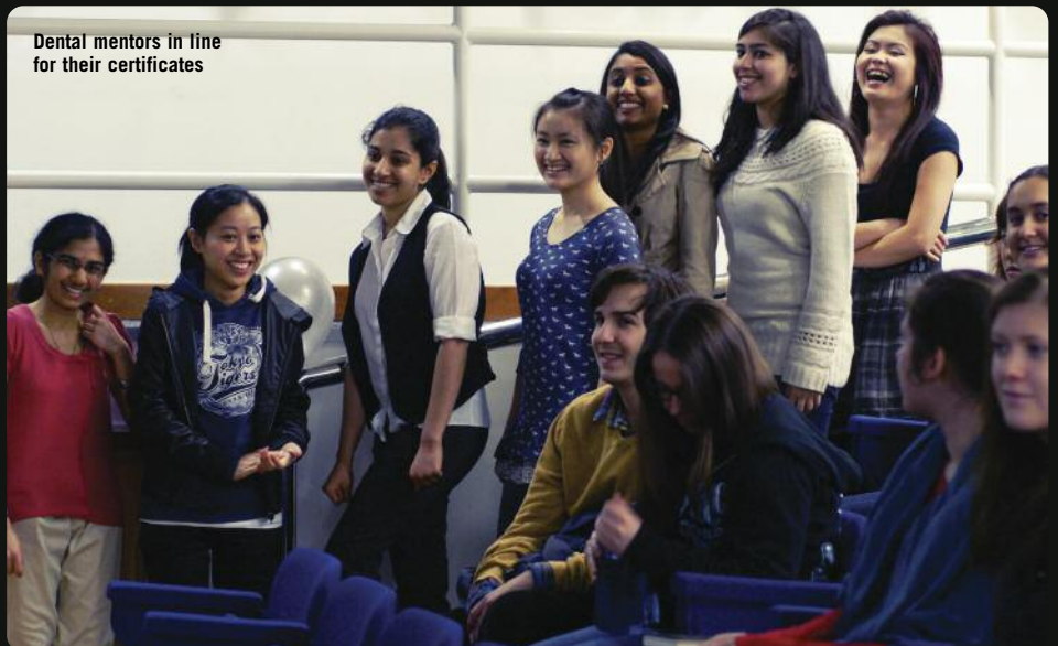
Dental mentors in line for their certificates