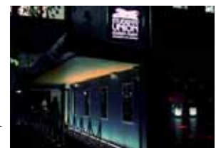
The red carpet awaits its first guests at the official opening of drapersbar

An extensive refurbishment of Drapers on the Mile End campus has resulted in one of the most impressive student venues in the country. drapersbar now boasts state-of-the-art audio visual equipment and sound and lighting, a High Definition projector screen for