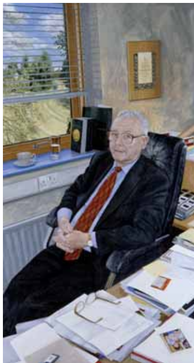
Sir Peter Mansfield by Stephen Shankland 2008

a new BBC Four four-part TV series aired last October. He took over as Simonyi Professor for the Public Understanding of Science at Oxford in December 2008.