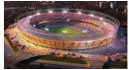
The London 2012 Olympic Stadium

At its peak, there will be 23,000 workers on the Olympic Park site; there are currently 2,500. Through a local training framework, 20 per cent of these jobs will be committed to people living in the five Olympic boroughs.