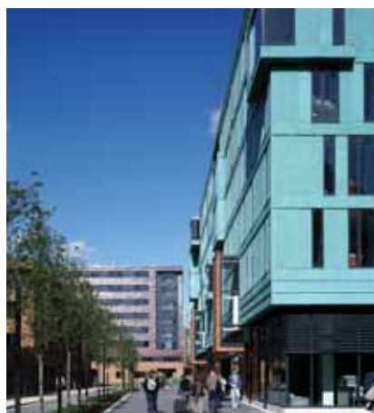
The Westfield Student Village

For the Olympic weeks in July and August 2012, every hotel, hostel, spare room or floor space will be full when the Olympics and the world come to London. Queen Mary's self-contained modern campus, the Westfield Student Village, located less than two miles west of the Olympic site, will supply 1,000 bedrooms during the Olympic and Paralympic Games. While the athletes and the officials will be housed in the Olympic Village at Stratford, the media and members of the administrative support for the national sports teams could well find themselves with canal-side views, living on the Queen Mary campus.