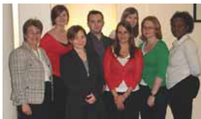
The Alumni Relations & Events team, December 2008

DISCLAIMER: Opinions expressed in this magazine are those of the individual writers and contributors