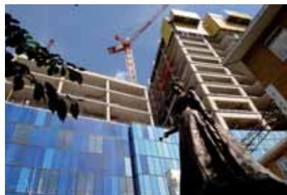
The statue of Queen Alexandra stands in the shadow of the new hospital building at The Royal London