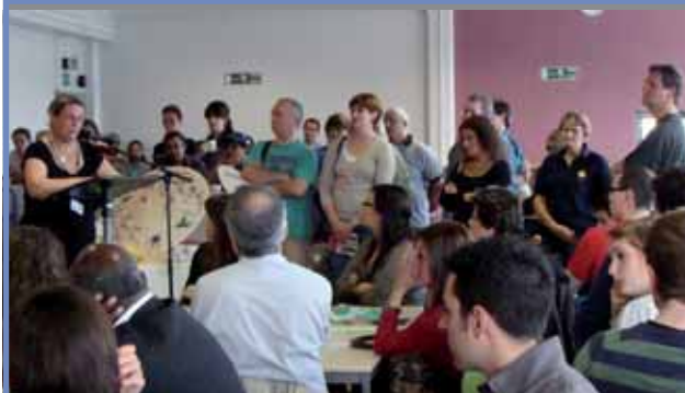
Over 1,000 parents and new students enjoyed coffee and cake at the annual Family Welcome, organised by the Alumni Relations Office during Moving-in Weekend.