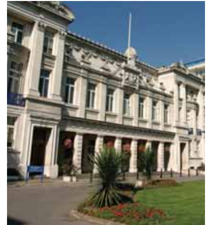
Queens' Building, Queen Mary, University of London

Queen Mary is keen to maximise the opportunities for permanent regeneration to east London that the Olympic Games offer. The College has pledged its student residences to the London Organising Committee of the Olympic Games to house visitors in 2012. It is also working on a number of projects connected with the Games, with North East London partners.