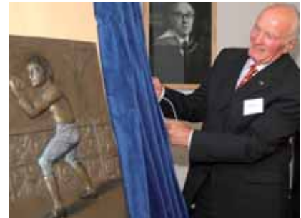
Sir Henry Cooper unveils the Mendoza plaque

Mendoza was originally buried in a Jewish Cemetery which now forms part of campus, but his remains were moved to Essex in the 1970s. Several British boxers attended the ceremony at the College, including Sir Henry Cooper who unveiled a bronze plaque.