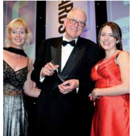
Professor Peter Hennessy and other prize winners

Professor Peter Hennessy , FBA, Atlee Professor of Contemporary British History at Queen Mary, was awarded the Times Higher Education's Lifetime Achievement Award for 2008 at a ceremony on 23 October.